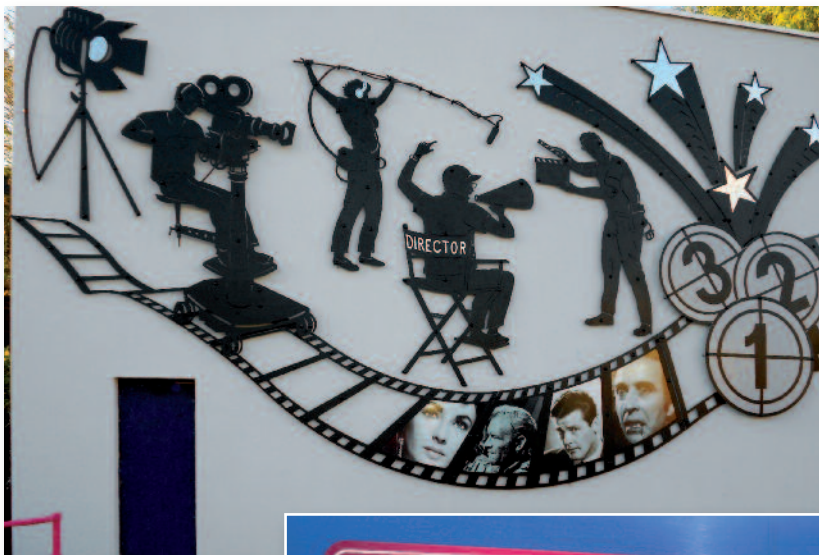
A proud tribute to those that work behind the scenes

First Impressions is a partnership between Hertsmere Borough Council, Elstree and Borehamwood Town Council, Hertfordshire County Council, First Capital Connect and Elstree Screen Heritage.