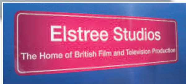
All aboard the Elstree Studios...