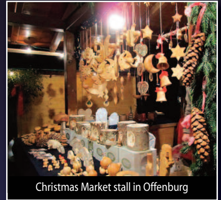
Christmas Market stall in Offenburg