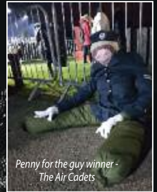
Penny for the guy winner - The Air Cadets